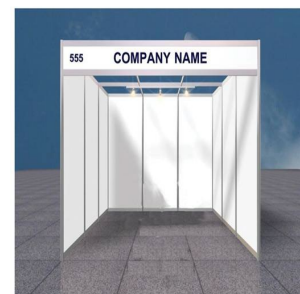
Shell Scheme Stand Sketch (For illustrative purposes only)

Please note: space only/shell scheme rental does not include any furniture, or booth cleaning. All these services and others will be available to order in the Exhibitors' Technical Manual.